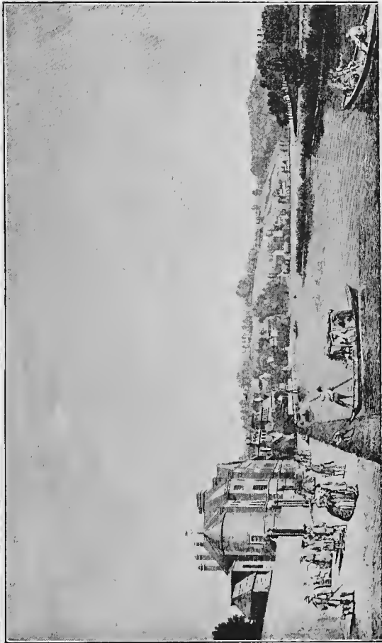
WILLIAM, FOURTH DUKE OF QUEENSBERRY'S MANSION AT RICHMOND, SURREY.